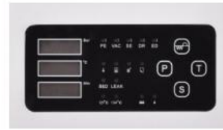
Digital display Simple operation, concise interface, easy-to-understand indication of working status.