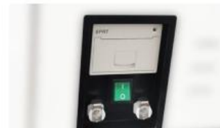
Integrated box: Mold-integrated integration, and simple operation.