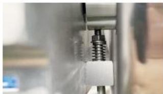
Adjustable door hook: The door seal can be adjusted by itself (12 equal parts of 30 degrees, the adjustment accurate to 0.1mm)