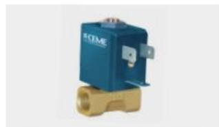
Solenoid valve: CEME, Italy withstand a pressure of more than 6KG